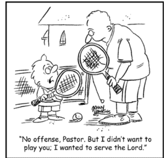
"No offense, Pastor. But I didn't want to play you; I wanted to serve the Lord."